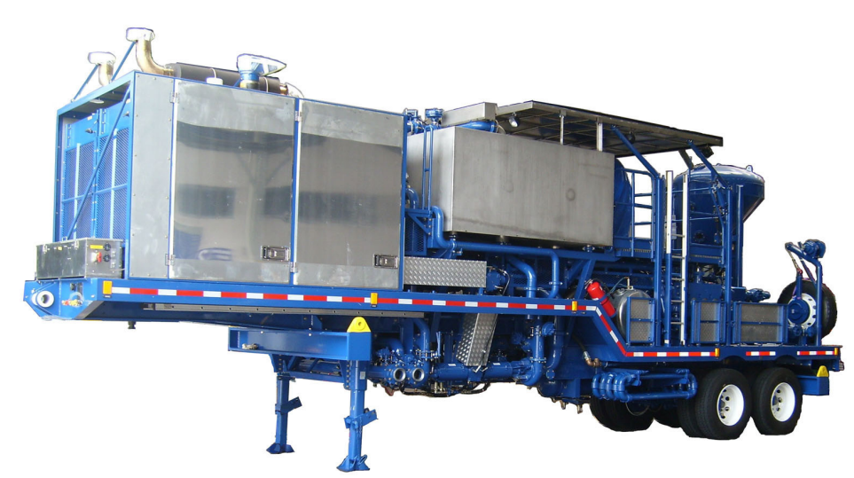
CPF-577 double-pump cement trailer.

The CPF-577 has four direct-drive centrifugal pumps to mix the cement slurry, pressurize the triplex pumps, and deliver water to the unit. CemCAT cementing computer-aided treatment is used with this pump trailer to monitor and record sensor signals at the wellsite during pumping operations.