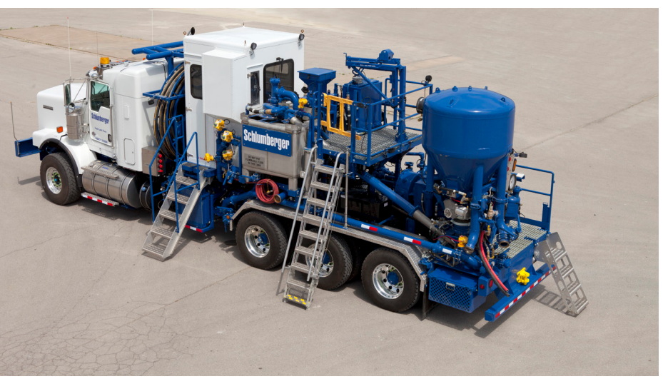
CPT-179 single-pump cement truck.*

The CPT-179 unit features an equipment interface module (EIM) that acts as both an electronic pressure trip and a backup data acquisition system for the primary distributed control unit (DCU). The SlurryAirSeparator* mechanical cement slurry defoamer removes entrained air from the slurry, and when combined with a retractable 55-ft<sup>3</sup> [1.6-m<sup>3</sup>] surge can, enables good cement delivery and slurry density. The unit can also be operated with a gooseneck for direct cement delivery from a silo or air slide.