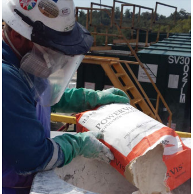
The POWERVIS viscifier is available in dry or liquid form, enhancing operational flexibility.

POWERPRO CT fluid requires POWERVIS viscifier concentrations of only 0.875–1.25 lbm/bbl [2.4–3.6 kg/m 3 ]. Additionally, the viscifier is available in both dry and liquid forms, enabling more flexible mixing options.