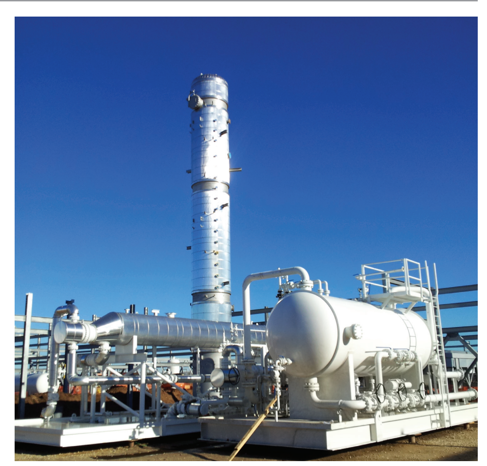
Schlumberger condensate stabilizers improve midstream operations by separating NGL fractions and converting them into Y-grade NGLs or suitable hydrocarbon liquid products.

NGL or condensate stabilization involves flashing the volatile light ends from raw liquids using controlled conditions to produce a more suitable product for market. Schlumberger has designed an optional wellsite NGL recovery unit to separate NGL fractions to produce Y-grade NGLs or other suitable hydrocarbon liquid products. Our wellsite condensate stabilization units are designed to