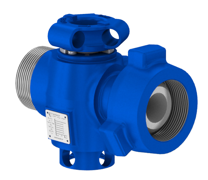
Cameron 2-in × 2-in flow iron plug valve.