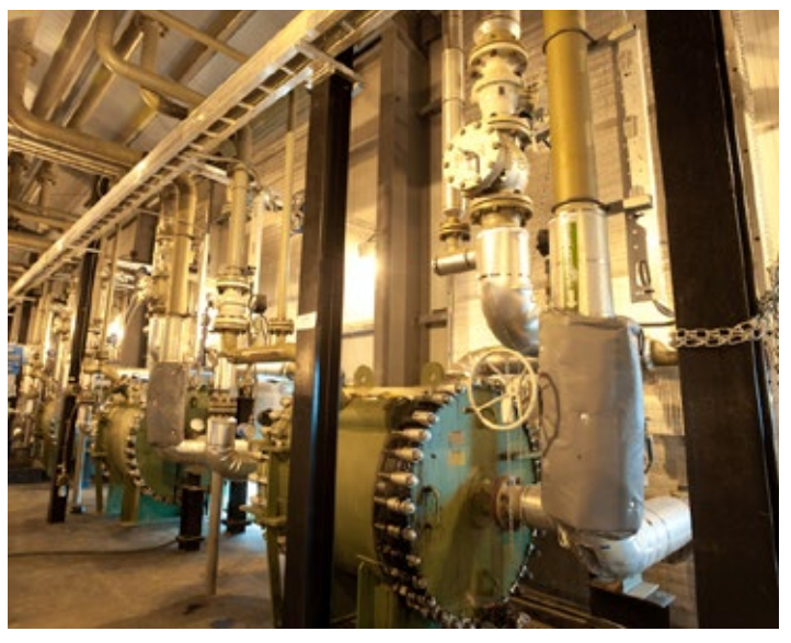
There are three methods of wastewater disposal: surface water discharge, subsurface discharge, and land application for beneficial use (also known as reuse).

The water used in various processes, whether from processing applications or extracted from oil, must be disposed of safety as regulated by federal laws, including the Clean Water Act (CWA) and the Safe Drinking Water Act (SDWA). This can be achieved by storing the water in tanks or reinjecting the water thousands of feet into underground wells. These applications, however, would quickly destroy a standard carbon steel valve. Our WKM floating ball valves in stainless steel and DEMCO gate valves in aluminum bronze are routinely chosen for these unique challenges because of their ability to withstand the corrosive effects of the wastewater.