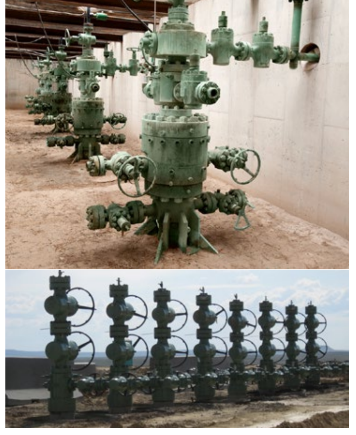
Cameron engineers selected the best suited features for development and implementation into our API 6A gate valve product line. Our valve line includes some of the world's most successful and widely recognized gate valves for onshore production.