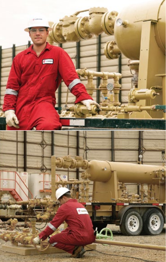
Cameron is one of the most respected names in the valve business, and our team is ready to respond at a moment's notice or as part of your long-term valve asset management program.