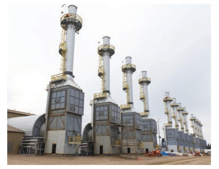
SAGD produces a smooth, even production and when in operation at reservoir pressure, instability problems that plague all high pressure steam process are usually eliminated.

The duplex stainless steel and Stellite seating configuration of the WKM TOV has been engineered to withstand the particularly abrasive, corrosive service environment found in SAGD and production applications. Designed and tested to perform reliably after thousands of cycles, the design of the WKM TOV helps extend the service life of the production system.